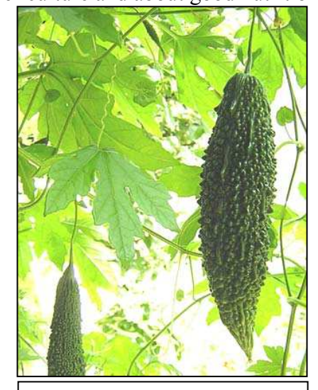
Bitter Melon