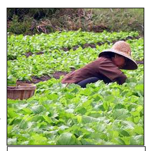
Khmer farmer harvesting mustard greens in Dracut, MA

In the Boston area, the New Entry Sustainable Farming Project (NESFP) assists immigrants with agricultural experience to apply their skills in their new environment and become commercial farmers. Currently