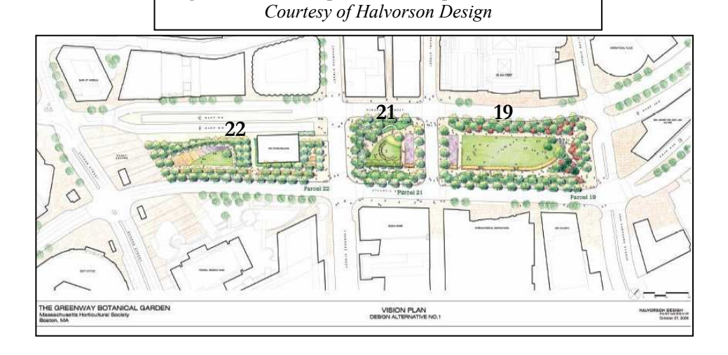
Figure 5. An example vision for parcels 19, 21, 22

Though their plans have not yet been finalized, MassHort expects to create open park space on all three parcels initially and to construct a multi-function building on Parcel 22 in a later phase of development. MassHort has been working with Halvorson Design<sup>7</sup>, a renowned Boston-based landscape design firm, to sketch different possibilities for its parcels (see Figure 5). The demonstration food garden is most likely to be placed on Parcel 21, which is just over a third of an acre in size. While MassHort has not determined how much of the parcel to dedicate to a demonstration food garden, it will realistically be no larger than a quarter of an acre. Aside from other factors, the size of the garden is limited by the amount of sunlight that reaches the parcel. Only three-quarters of the parcel ( \sim 0.25 acres) receives six or more hours of sunlight daily from late April to late August, which is the minimum length of daylight needed to support most of the plants that would likely be grown (see appendix A for the sunlight study).