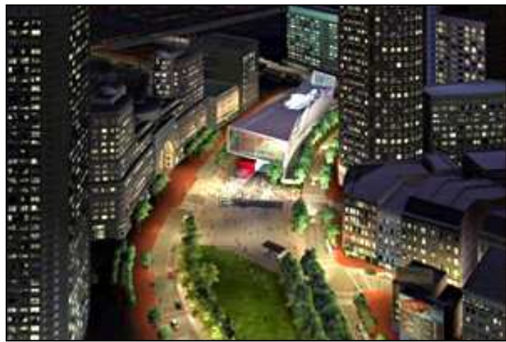
Figure 2c. Vision of the Greenway at Night