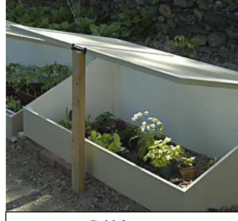
Cold frames

Some offer free cover crop seeds for members to plant on their plots. Cover crops provide protection for the soil and can add a decorative element to the garden. Of those surveyed, 28% had part or all of their garden beds seeded with cover crops. The most popular cover crop used was rye, but some gardeners used clover and fava beans.<sup>27</sup> One manager emphasized the importance of sowing the cover crop by late October to ensure that the crop has enough time to establish itself before it gets too cold. Mulch was used by members in a third of the organizations to cover their garden beds in the wintertime. In 24% of the organizations, we found that some members used a season-extending growing Cold frames<sup>28</sup> and greenhouses are most technique. commonly used, but plastic row covers were also