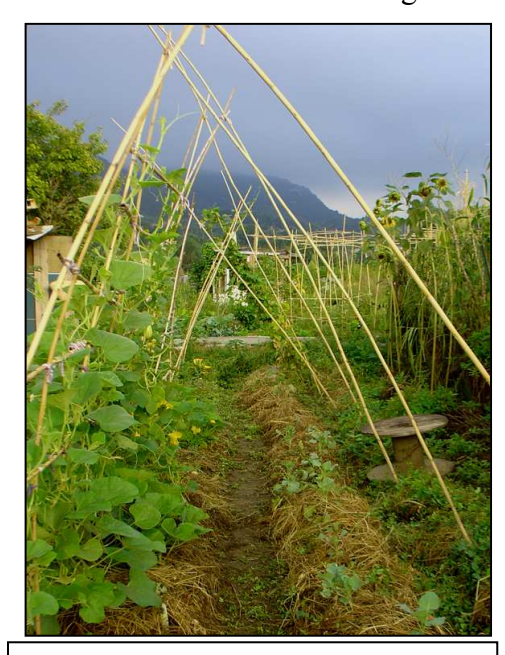
Bean Teepees

area if it is logistically feasible. Of course, the trees should be placed with care to prevent the vegetable beds from being shaded by the tree canopy. resistant varieties should be selected. Fruiting bushes and vines should also be grown in the garden (this is also discussed in the Fencing and Buffer section) as visitors seem to really enjoy them. We recommend that other perennial food plants and herbs (i.e. asparagus, rhubarb, mint, chives, etc) be included in the garden as they can be used in educational programming to teach people about plant lifecycles and they require very little labor to Asparagus is quite an incredible looking perennial and might help draw attention to the garden space. Finally, we recommend that the garden include demonstrations for growing plants vertically. previously mentioned examples are certainly great ideas to replicate. Gardeners will enjoy learning about these techniques, and visitors in general will be entertained by the creativity and novelty of it.