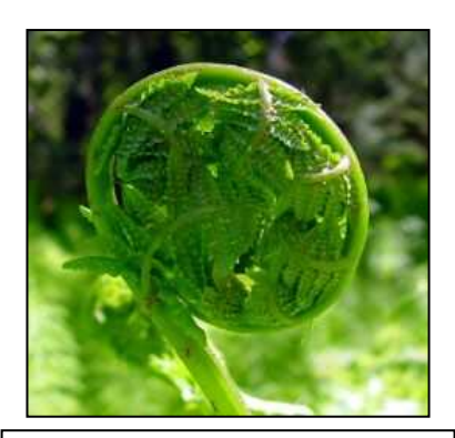
Fiddlehead Fern