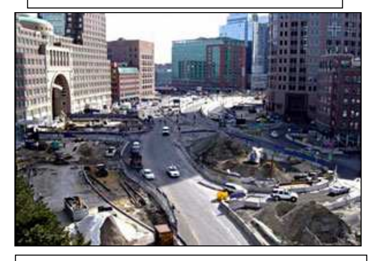
Figure 2b. Vision of the Greenway during the Day