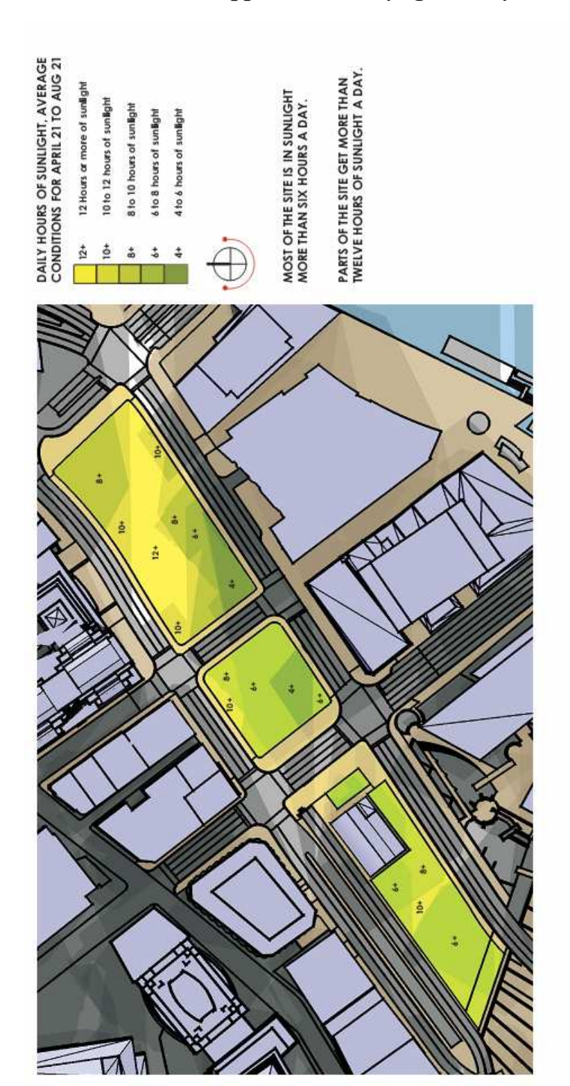
Appendix A: Daylight Study