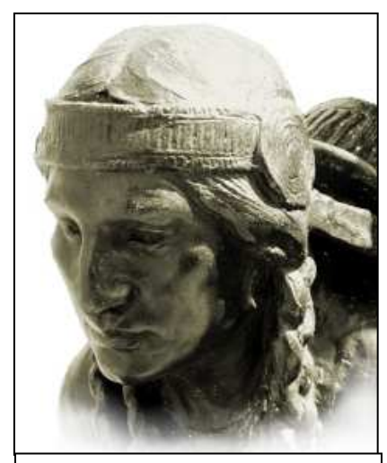
Squaw Sachem, leader of the Massachuset

Our state is named for the Massachuset Tribe, whose territory stretched from modern Salem in the north to beyond modern Brockton in the south. Sadly, the Massachuset fell victim to epidemics brought by the settlers from the Old World, and none remain today. But they have much to teach