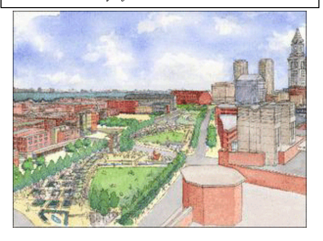
Figure 3. The Greenway Conservancy's Vision

The Rose Fitzgerald Kennedy Greenway Conservancy was established to oversee the fundraising, operation, planning, and maintenance of the Greenway. As community groups and government officials grew eager to see development begin, the Conservancy enlisted numerous designers to provide conceptualizations of a central promenade complete with parks, gardens, and fountains, as well as cultural facilities, an outdoor cafe, and areas for largescale events (See Figure 3). The Conservancy was tasked with raising $20 million by the end of 2007, with the MTA promising to provide up to $5 million to match all private-sector